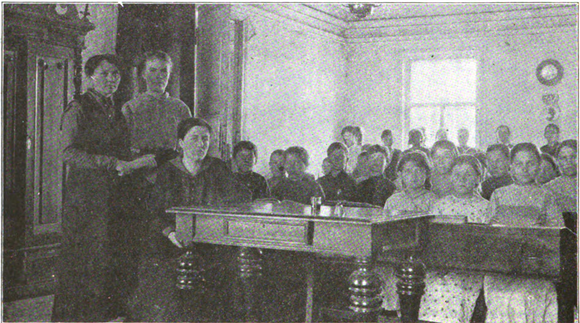
One Of The 10,000 Schools Started By The Bolsheviks

"I had a capital opportunity to see the efficient working of Soviet food control, for in taking twelve hundred Serbian refugees across Siberia for the American Red Cross, I had normal business relations with more than one hundred soviets over three thousand miles of territory. These were refugees