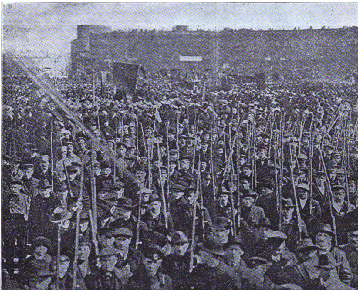
“Mass Action” Before The Winter Palace

“Lenine says the policy of the Bolsheviki is to take over these industries that have reached the monopolistic stage, and then the others as fast as the new government can swallow them. It may be said that the industries not now owned by the workers are controlled by the workers.