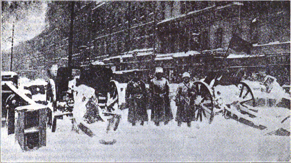
A Russian City Street In The Days Of The Revolution

man Embassy building, with an inscription something like this beneath it: 'See the building of the German Embassy, with a banner above it bearing the words of a great German. Is it Bismarck? No. Is it the Kaiser? No. It is the immortal Karl Marx, and his words are: 'Workers of the World, Unite!' Now we throw back to you the words of your great countryman and ask you to unite. We Russians have taken the words seriously and all power is now in the hands of the workers. How long will it be before a German Socialist will come as Germany's ambassador?' Besides these, pamphlets were got out in English, French, Swedish, Turkish, Musselman and Chinese. I came in close contact with these propaganda workers while I was working for the American Y. M. C. A., getting out and distributing copies of President Wilson's Fourteen Point speech. The Russians liked that speech and agreed with most of its fourteen points, but they were a little sceptical as to whether the Allies would stand by it.