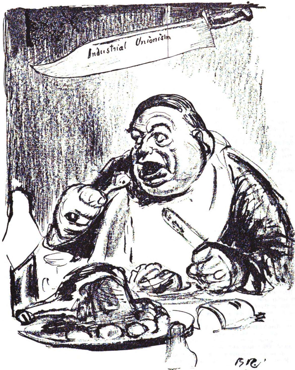
Hogging the Eats