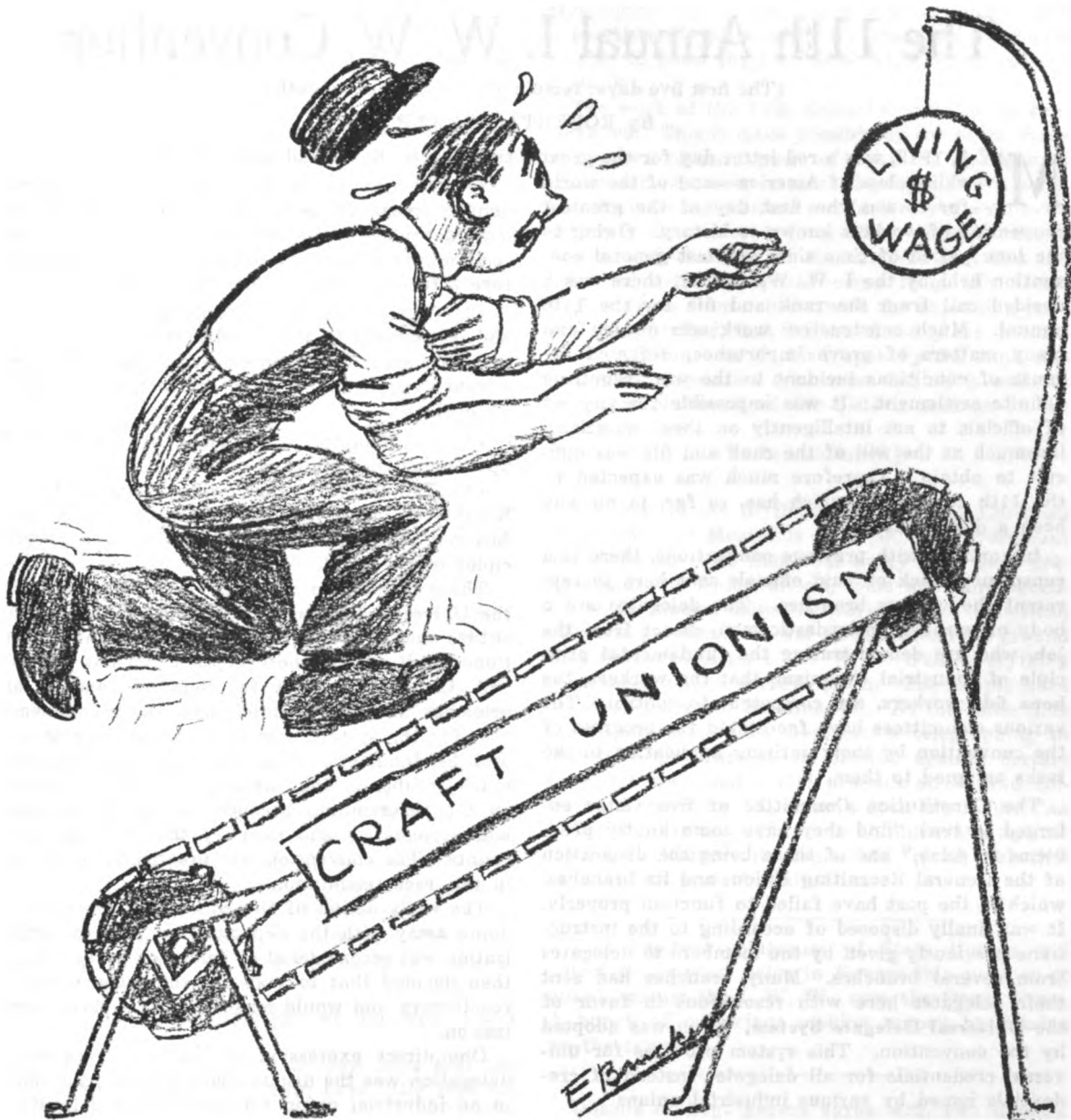
The Endless Chain